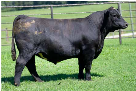
BGIBBS 1160J DAISY 4253B Son of Kenworth.