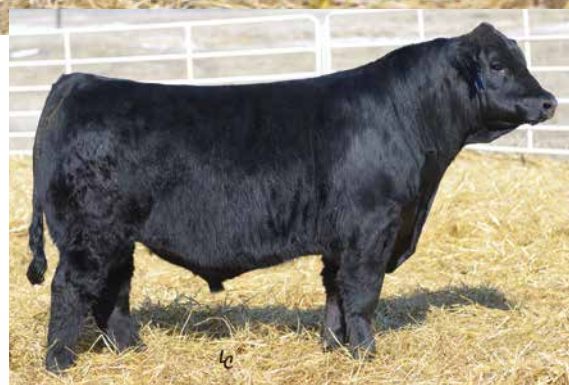
KBHR HIGH ROAD Sire of Highlife.