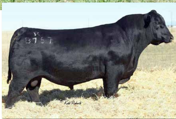
TEHAMA TAHOE B767 Sire of Rarity.