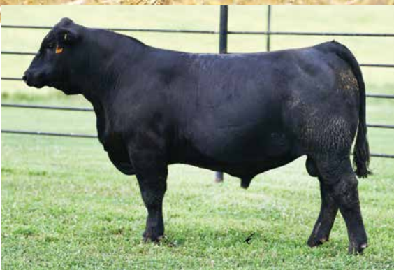
GIBBS 9190G WIDE ROAD Son of High Road.