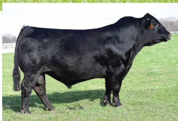
WS PROCLAMATION E202 Sire of Enhancement.