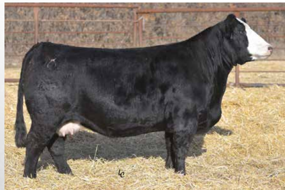
HHS MISS 836Z Paternal grandam of Reserve.