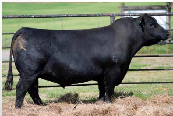
GIBBS 9121G KENWORTH Sire of Kingpin.