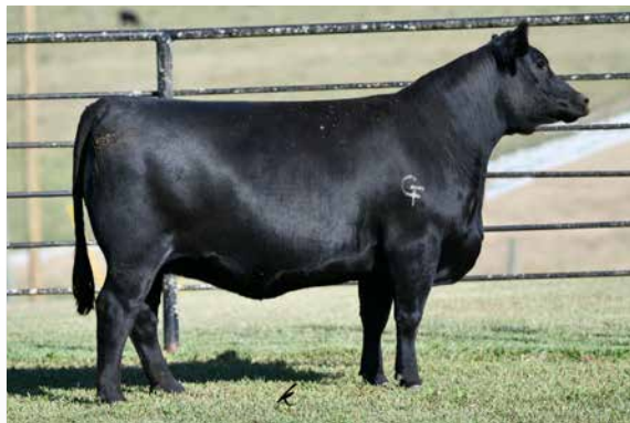
GIBBS 7248E FANCY 3008A Daughter of Mountaineer.