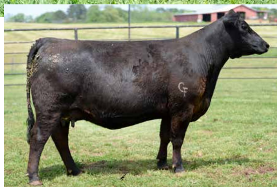
GIBBS 8028F FANCY 6138D Dam of Kingpin.