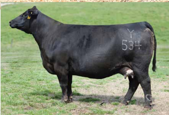
SSF BLK LOUISE Y534 Dam of Broad Range.