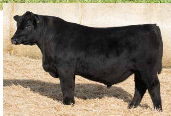
TERS KODIAK 206K Son of Essential.