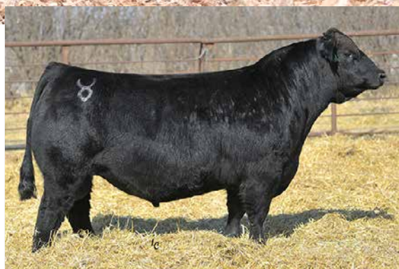
EGL FIRESTEEL 103F Sire of Fire Power.