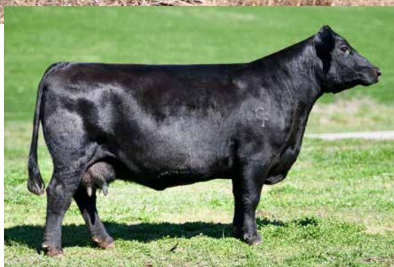
GIBBS 0532X SM STAR P342 Dam of Kenworth.