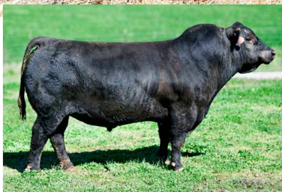
BGIBBS 5377C HILLBILLY Son of Mountaineer.