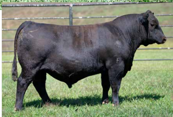
GIBBS FAST TRACK 0634H Son of Triple Crown.