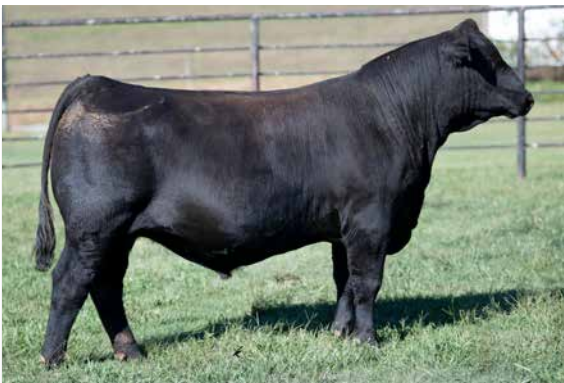
GIBBS CADILLAC 1098 Son of Broad Range.