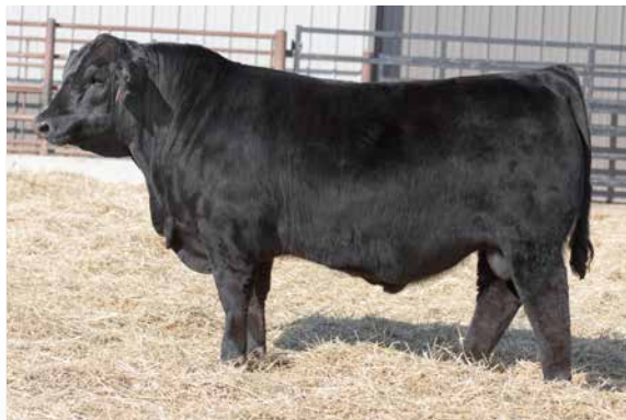
CLRS HERDBOOK 316H Son of Triple Crown.