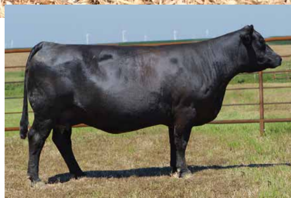
CCR MS 2073 COWBOY 5171C Dam of Bedrock.