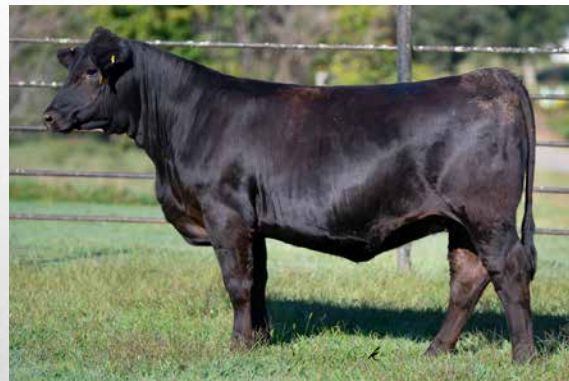
GIBBS 1033J BLT 4080B Daughter of Essential.