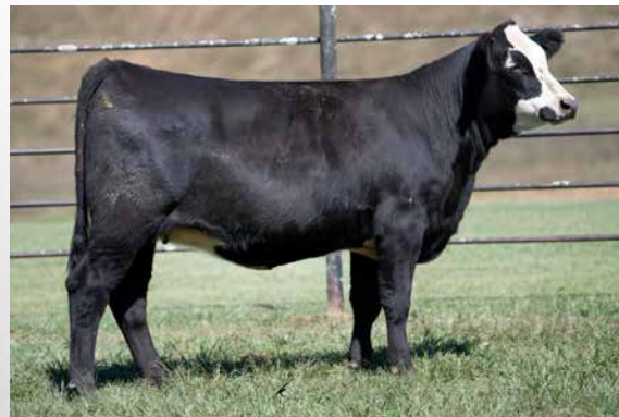
GIBBS 1029F DOE 9083G Daughter of Stone Cold.