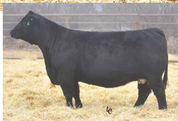
WS MISS SUGAR C4 Dam of Honor.