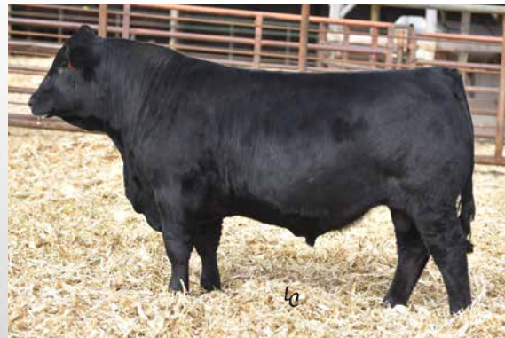
HOOK'S BEACON 56B Sire of Honor.