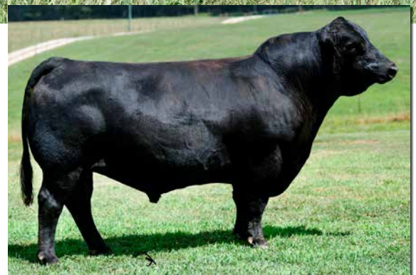
GW TRIPLE CROWN 018C Sire of Hilltop.