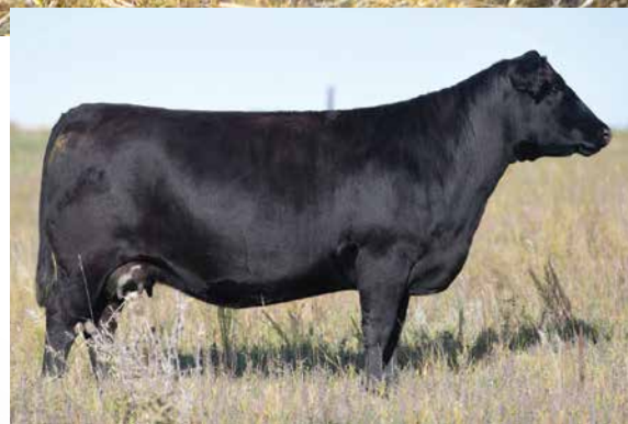
LCDR MS CHLOE 55C Maternal grandam of Reserve.