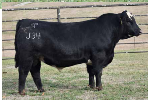
BXFM FROST BITE J34 Son of Stone Cold.